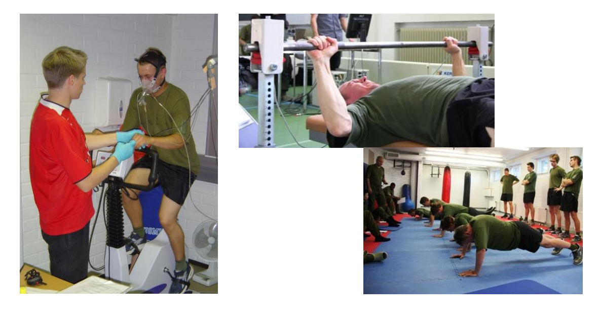
Figure 1. Maximal oxygen bicycle ergometer test (left), bilateral isometric strength test for the arm extensor muscles (middle), and push-up test (right).

Furthermore, muscle strength and endurance are also important factors in many daily activities of soldiers. In the present neuromuscular tests, bilateral isometric maximal strength of the arm and leg extensors, grip strength, and muscle endurance (recording of the number of repetitions in one-minute push-up, sit-up and squat actions) were utilized (see Figure 1).