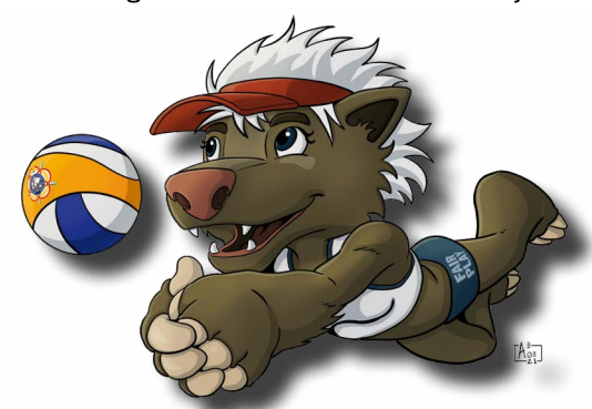
YOUR LIFE IS YOUR MESSAGE: "PLAY TRUE"

True Sport is the essence of sport, the spirit of Sport, that inspire athletes, coaches, parents, and administrators to change the culture of youth sport through cornerstone lessons of sportsmanship, character building, and clean and healthy competition.